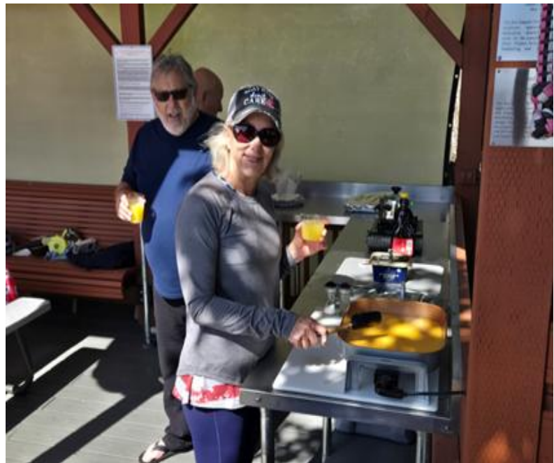
The Stevensons starting the day right