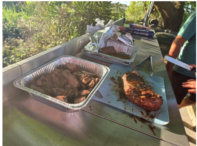
Tri Tip is ready, lets eat!